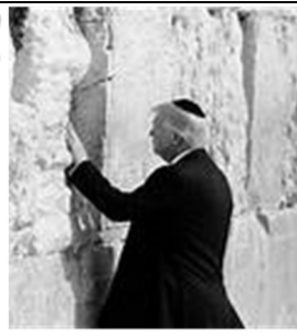
Pres. Trump at the Western Wall

"I will bless those who bless you (Israel), and the one who curses you I will curse!" (Genesis 12:3)